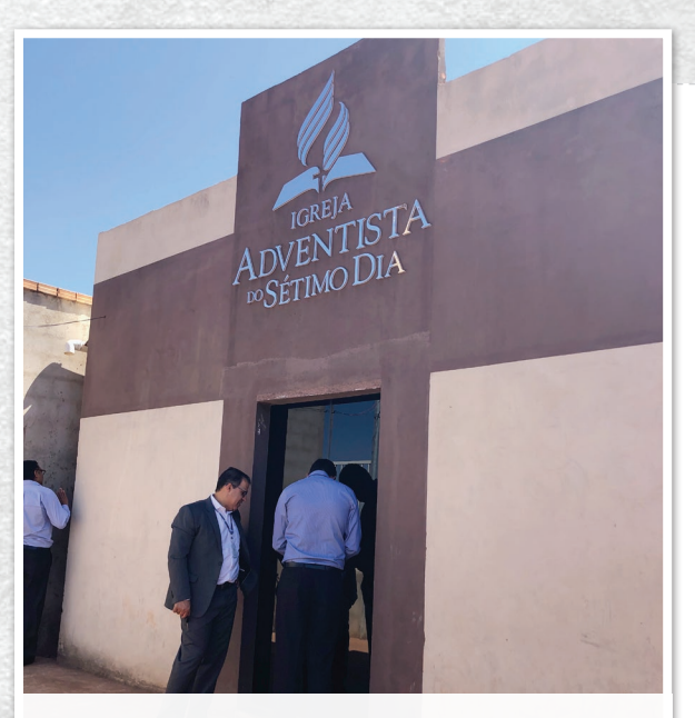
Once the new group of believers in Novo Gama grew large enough, they built this church for their community.

Adventist beliefs and, with his family, joined this new group. He tried to quietly resign and turn his church over to another pastor, but many of the members of his church decided