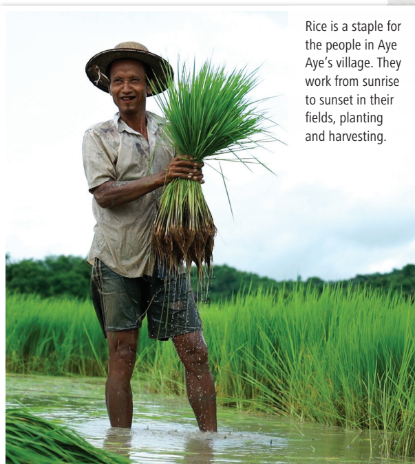
Rice is a staple for the people in Aye Aye's village. They work from sunrise to sunset in their fields, planting and harvesting.

light of the three angels' messages. If you'd like to help place pioneers in this challenging area, please visit Giving.AdventistMission.org and select "Reaching the 10/40 Window."