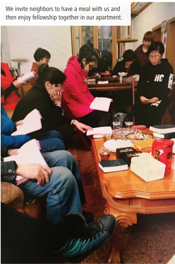
We invite neighbors to have a meal with us and then enjoy fellowship together in our apartment.