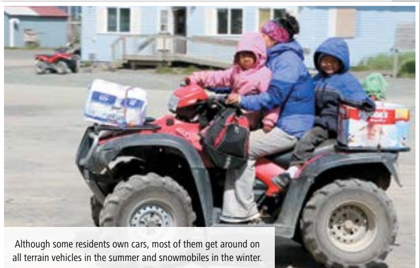
Although some residents own cars, most of them get around on all terrain vehicles in the summer and snowmobiles in the winter.